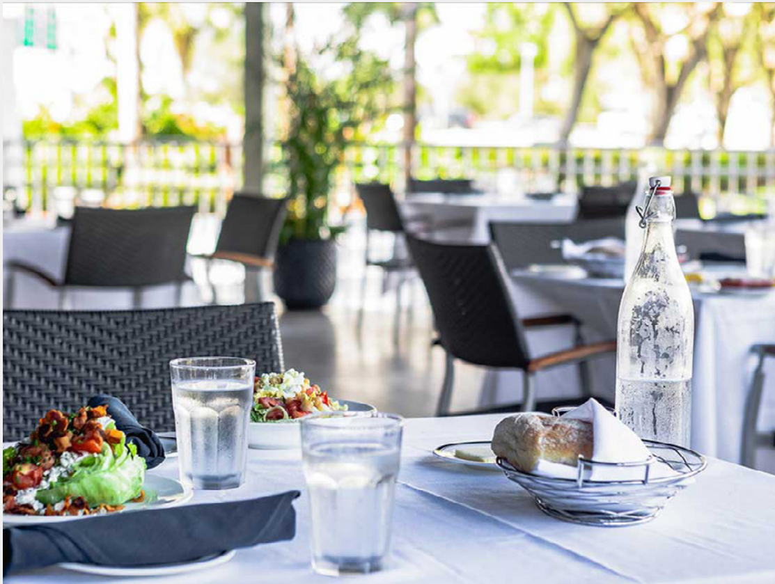
CITY FISH MARKET