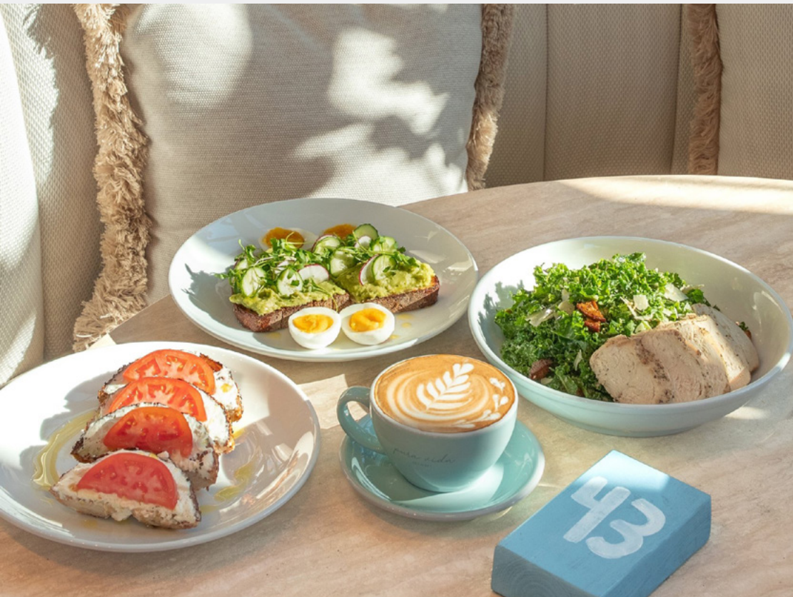
PURA VIDA MIAMI