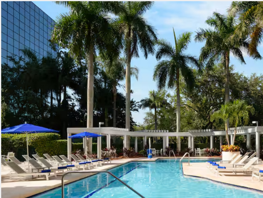
HILTON BOCA SUITES