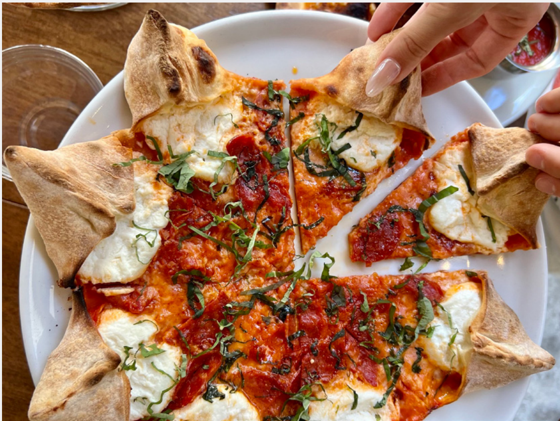
Mister O1 Extraordinary Pizza